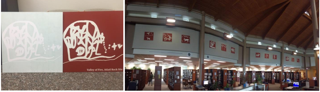
Petroglyph art – before & after

Indie Author Day, Sun. Oct. 9<sup>th</sup>, 2-4 PM