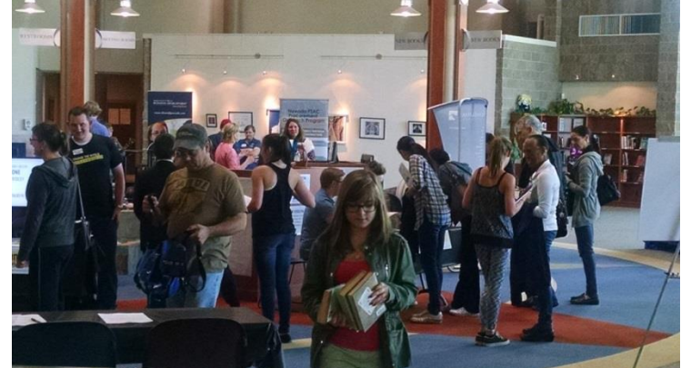
StartUp Faire @ SS, Sunday May 22<sup>nd</sup>, Noon-3:30 PM